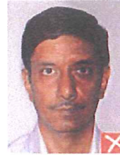
Shadow across the face.